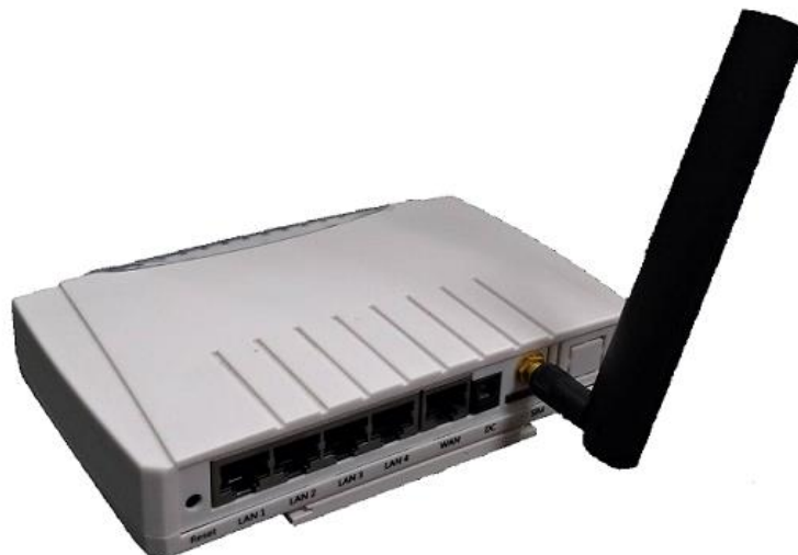
Figure: G2Wifi III with internal 4G LTE module

Model: G2Wifi III_EC25 (LTE module could be changed as request)